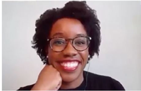
Representative Lauren Underwood