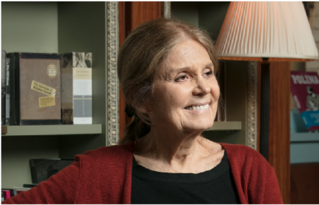
Gloria Steinem