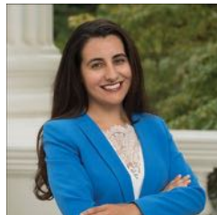
SD 19 - Assemblywoman Monique Limón

Strategic progress en route to 50/50: an unexpectedly strong finish to the 2014-2020 election cycles, which offered relatively few open and competitive seats, sets our campaign up optimally to expand recruiting in preparation for the coming 2022-2028 cycles, when a minimum of 96 of 120 total legislative seats will be open. Our Motherlode strategy to reach 50% women by 2028 is on track.