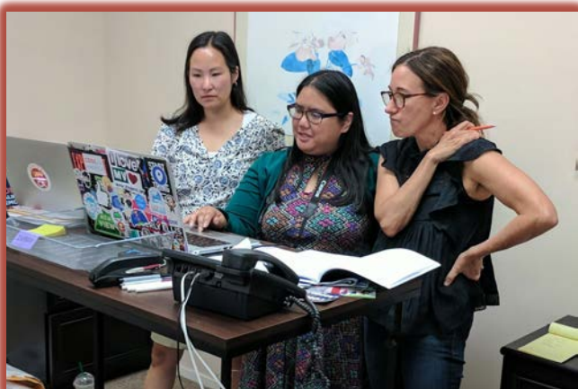
Team CTGCA sweating out the summer in our war room