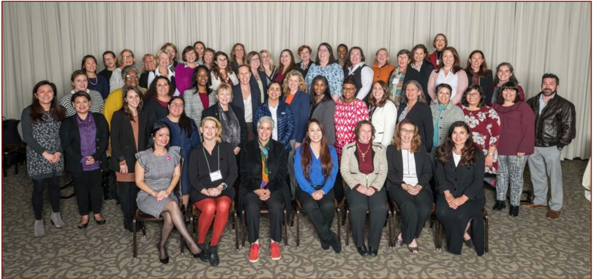
Faculty & Prospective Candidates at the December 2018 Sacramento Symposium