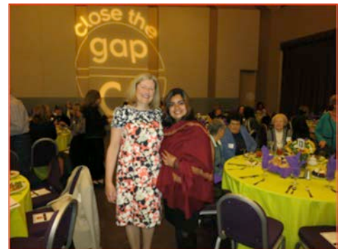
200+ attend Silicon Valley LLL in March