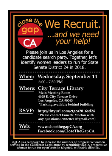
ctgca has TWO upcoming search parties in the Los Angeles area!

-SD 24, Wednesday, 9/14 RSVP <u>here</u>