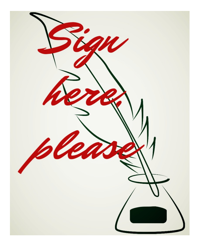
September 7, 2016

Congratulations to the women whose bills are awaiting the Governor's signature. They represent a giant step forward for California families. Women legislators have the power to change lives, open doors and multiply opportunities. Imagine what we could accomplish if women were half the legislature instead of a quarter. How amazing would that be?