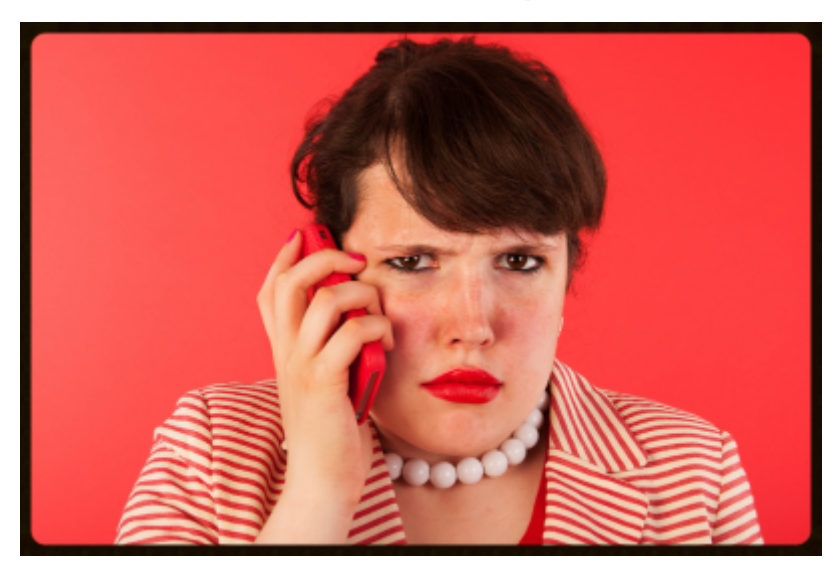
If you pitch in today, we will solve it.