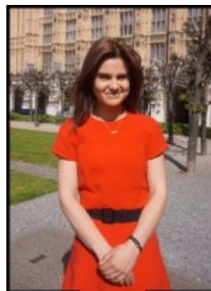
A moment of silence for MP Jo Cox , a public servant of rare dedication. More.

Will our first female president help bring gender parity to Congress? The data points to "yes"! Read the analysis here .