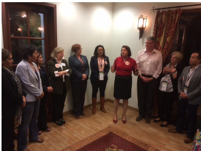
CTGCA, Emerge CA, CDC, and WIP PAC make the case for

However, if there's one thing the convention reminded us of, it's that there is a huge network of women and men who want more women to run and win. They'll do whatever they can to help. We, and our allies at Emerge CA,