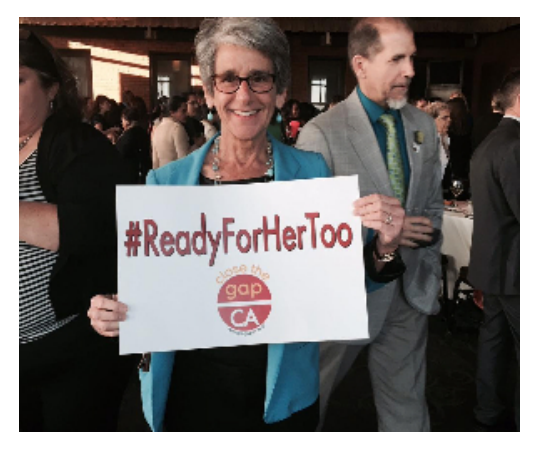
Right on, Senator Jackson!

Earlier this week we launched #ReadyForHerToo to remind people that we don't need just one woman in high office, we need lots of us in