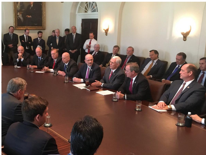
Donald Trump meets 30 men to discuss future of maternity care

If ever you have thought of running for office, now is the time to pursue it.