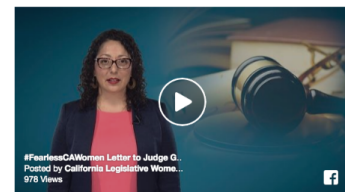
"California's female lawmakers to Supreme"