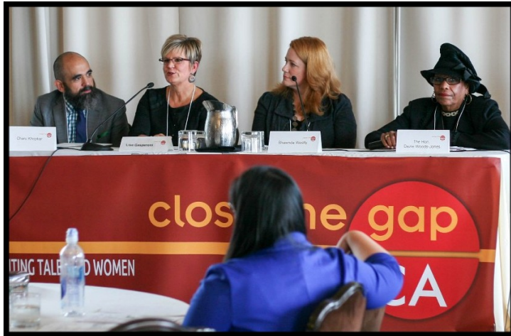
A panel speaks to prospective recruits at our 2015 Symposium in Sacramento.

close the gap CA offers prospective candidates a guided exploration of what it takes to run, win and serve as a state legislator.