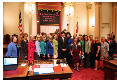
The women of the Senate honored March 16th on the Senate floor.