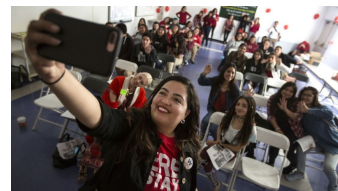
CTGCA Partners in LA Times