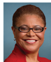
Hon. Karen Bass