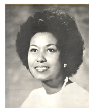
Hon. Yvonne Brathwaite Burke

Today we send our thanks and congratulations. Thanks for all they have done and will do for us. Congratulations on their groundbreaking accomplishments. Learn more about each of them here.