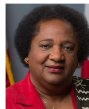
Hon. Shirley Weber