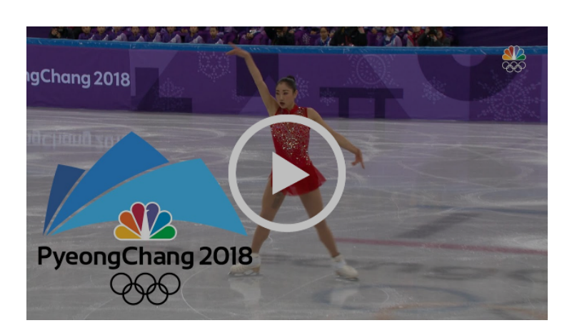
Congratulations Mirai Nagasu! Read more

close the gap CA is a statewide campaign to find talented, progressive women to run for open seats in the California legislature in 2018 and 2020. With focus and a targeted strategy, we can 'close the gap' and not just the gender gap. When we elect progressive women, we take steps to close the school funding gap, the access gap to affordable health and reproductive care, and the growing gap between the wealthy and those in poverty.