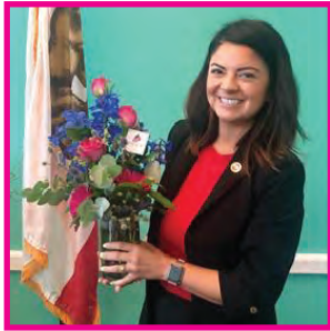
◀ Sen. Gonzalez, with CTGCA welcome bouquet

with Hon. Lena Gonzalez, elected June 4th, 2019