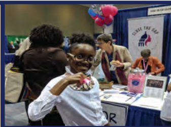
Booth visitors loved our pink rings