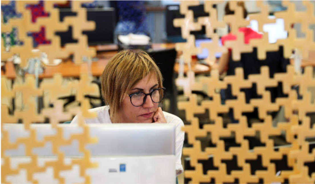
Researchers found that at least a quarter of the growth in U.S. GDP between 1960 and 2010 is the result of greater gender and racial balance in the workplace.