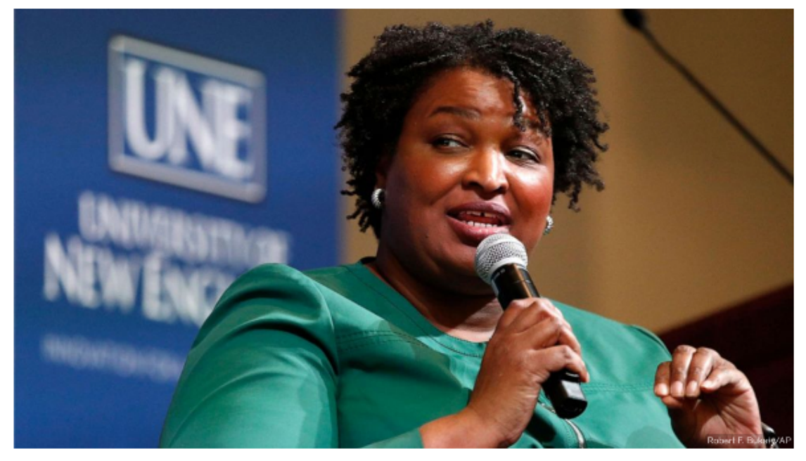
Stacey Abrams speaks at the University of New England, Jan. 22, 2020, in Portland, Maine.