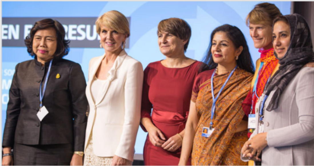
A special event at the November 2016 UN climate change conference in Marrakech highlighted women's leadership in addressing climate change.