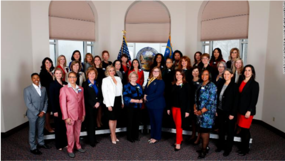
The 32 female members of the Nevada Legislature photographed in Carson City, Nevada, on February 4, 2019. They are the first female majority Legislature in the US.