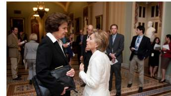
Senators Feinstein and Boxer

Feinstein and Boxer: An interesting reflection on the 24-year partnership of the first two female Senators elected to serve their state together. Read it here .