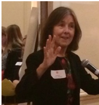
New State Sen. Nancy Skinner shares her enthusiasm with the room.

Please enjoy these photos from our reception: