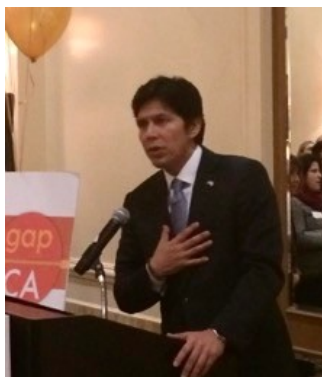
The President Pro Tem congratulates the newly elected