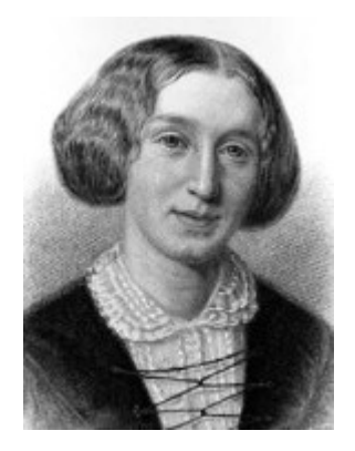
Number one: George Eliot

The BBC recently polled critics on the best ever British novels, and the results are in! Women authors took 4 of the top 5 spots, and 6 of the top 10. Here are the top 5: