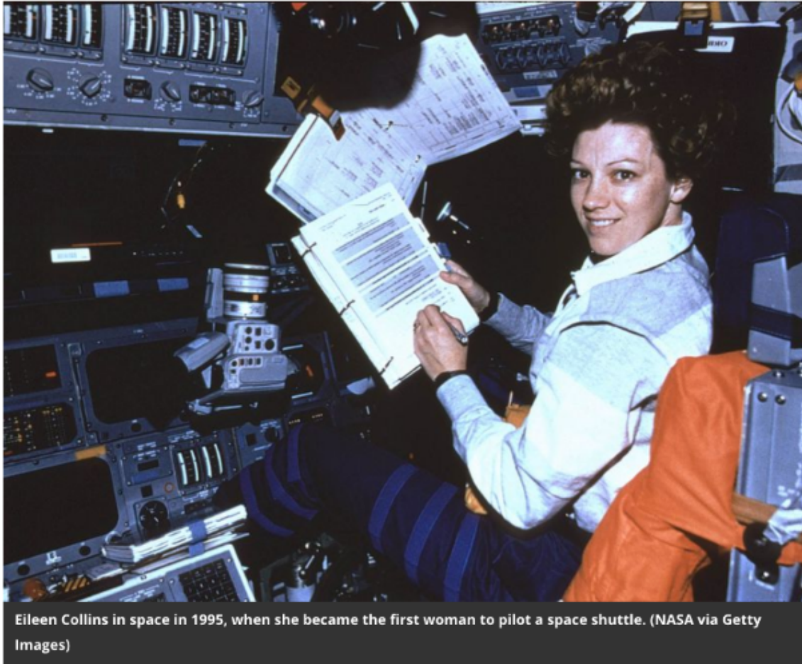
Eileen Collins in space in 1995, when she became the first woman to pilot a space shuttle.

Smithsonian Magazine interviews Col. Eileen Collins, the first woman to pilot a space shuttle.