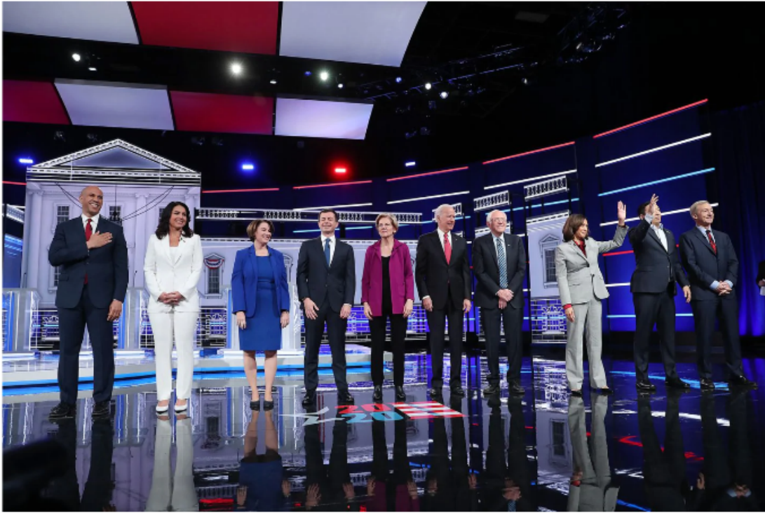
Sen. Cory Booker (N.J.), Rep. Tulsi Gabbard (Hawaii), Sen. Amy Klobuchar (Minn.), South Bend, Ind., Mayor Pete Buttigieg, Sen. Elizabeth Warren (D), former vice president Joe Biden, Sen. Bernie Sanders (I-Vt.), Sen. Kamala Harris (Calif.), former tech executive Andrew Yang, and billionaire Tom Steyer arrive on stage before the start of the Democratic presidential debate in Atlanta on Wednesday.