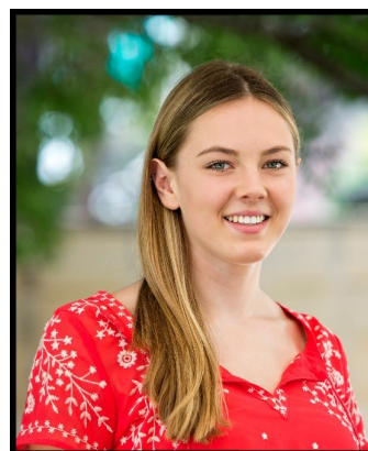
Meet our newest intern: